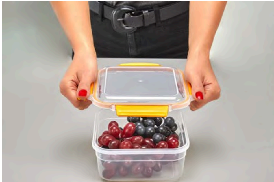
4 SIDES LOCKED